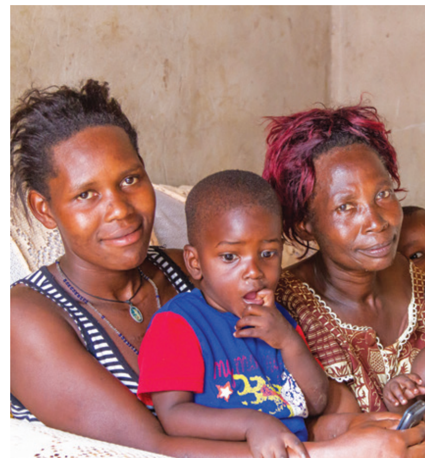
In Uganda, Climate Stewards funds bio-sand filters which remove the need to boil water, saving money and reducing pressure on remaining forests at risk of being cut down to make charcoal (Adrian Frost)