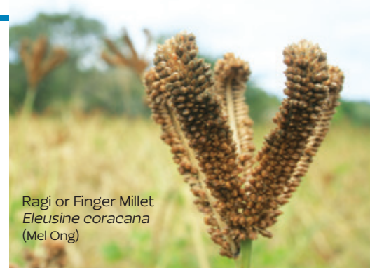
Ragi or Finger Millet Eleusine coracana (Mel Ong)

'With over 58% of the population dependent on agriculture for its livelihood, India is considered one of the countries most vulnerable to climate change. As a nation we are witnessing extreme weather events such as floods, droughts and cyclones.'