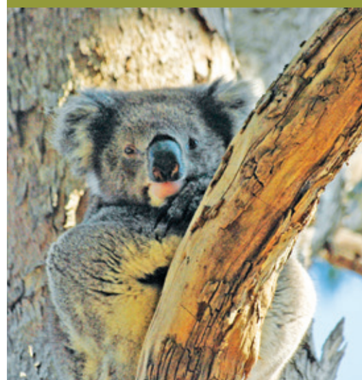
Koala Phascolarctos cinereus (Chris Naylor)

Your support is enabling A Rocha Australia to work with Cassinia Environmental, a pioneer in carbon farming in Australia, to carry out biodiversity studies on the Cassinia property. Through revegetation projects and ecological offsets, this partnership is developing creative ways to fund nature conservation and protect against climate change.