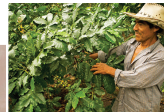
Supporting smallholders in Mexico (Climate Stewards)

Work out your own carbon footprint and look for ways to reduce it. Offset the rest with Climate Stewards. Check out the resources on our website for engaging your church or employer too.