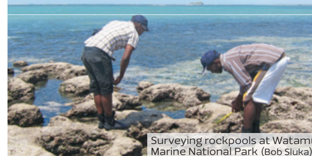
Surveying rockpools at Watamu Marine National Park (Bob Sluka)

'Corals are highly susceptible to the impacts of rising temperatures – bleaching has impacted coral reefs globally, including reefs within Watamu Marine National Park (WMNP) in Kenya. Corals occur in reefs as well as in other habitats and, in WMNP, there are important coral species, such as Anomastreaa irregularis , an IUCN Red Listed Vulnerable species.