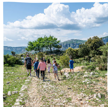
Working with the public