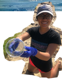
Tackling plastic pollution