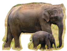
Elephant and human peacekeeping

A Rocha works across six continents to protect habitats through our biodiversity conservation initiatives. Examples of our land-based projects include human–elephant peacekeeping in India; preserving forests in Africa and Peru; collaboration with local communities; environmental education and sustainable livelihoods; habitat restoration; engaging churches in caring for creation; scientific research and discovering new species, and more. Join us in creating a home for all through A Rocha's conservation efforts.