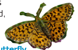
Butterfly and moth studies

From climate change to protecting winged and flying species, A Rocha's conservation work soars above land and sea, to the skies. Examples of this conservation work include climate change research in Portugal; nature-based solutions to reduce and offset carbon footprints with Climate Stewards; bird conservation across Portugal, France, Kenya, Canada, New Zealand and Czech Republic; bat research in New Zealand and France; beekeeping in Ghana, Czech Republic, Kenya, Switzerland and the UK; and butterfly and moth studies in Switzerland and France. Help us continue to protect species great and small, across land, sea and sky.